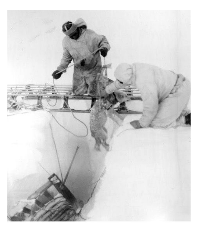
Figure 5. Dog being extracted from crevasse at West Base

While various methods of hitching a dog team to the sledge have been used, the USAS operations continued the practice employed by the previous two Byrd expeditions: the double tandem of nine dogs, with a single lead dog followed by four pairs attached to the central line at the neck and at the end of the harness. A