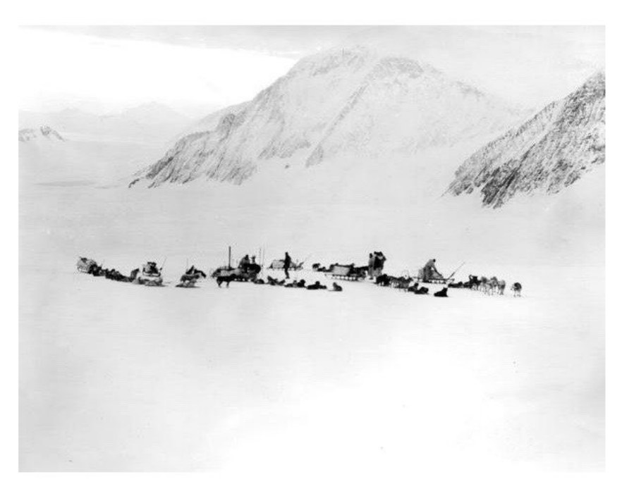
Figure 6. Fifty-five dogs on Mile High Plateau August 1940

Hilton's team decided to have no more, turned the team around and began to race downhill. Just at the edge of a drop-off, Hilton was able to stop them by digging his crampons into the icy surface (Black, 1941a, p. 77). A disaster had been avoided.