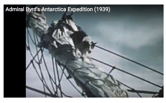
Figures 1-3. Eskimo dog on sail outing

After having endured the unbearable heat of the Equator, where awnings were put up on the fo'c's'le deck to protect the dogs from the sun, the crew and dogs were navigated through the Panama Canal— the Alaskan dogs now for the second time, and sailed through the Pacific Ocean towards a cooler climate. Off the coast of New Zealand, the ships encountered rough weather in the roaring 40's. The dogs were miserable.